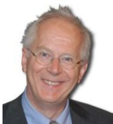
Professor Sir David Baulcombe

Plant Bioscience Limited (PBL) is pleased to announce that the United States Patent Office has allowed claims in its patent application 10/806,253 for detection of short RNA molecules to identify gene silencing in mammals and mammalian cells.